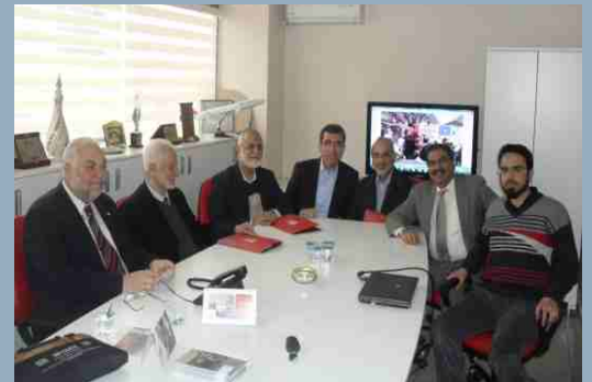
FIMA delegates at a get together arranged by DWW

Somalia relief; proposal to raise funds for FIMA relief), report of FIMA Save vision, FIMA Save smile, FIMA Save dignity, FIMA Mobile MCH clinic, report on Medical Students camps, FIMASAC , CIMCO, FIMA Advisory Council , FIMA Constitutional amendments, Islamic Hospital Consortium, 29th FIMA Council and FIMA-IMAM Conference 2012, Kuala Lumpur, Malaysia., FIMA Year Book 2010-11, FIMA UNECOSOC, FIMA e-newsletter & FIMA website, Bioethics/AIDS Awareness, FIMA Constitutional amendments, FIMA life achievement award and other miscellaneous items.