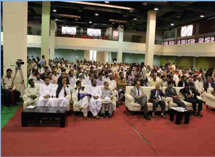
A view of public awareness seminar conducted in the pre convention session of PIMA Biennial convention Karachi