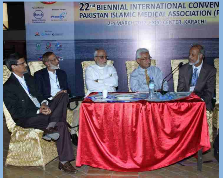
Panel discussions were held with dialogue on issues relating to Bio-ethics.