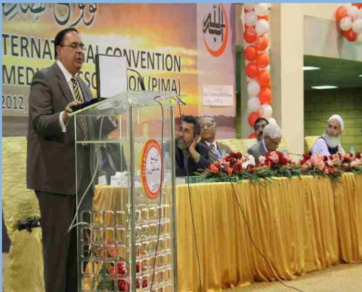
Dr Atta ur Rehman former Minister of Science and Technology giving his keynote address in PIMA Biennial convention Karachi