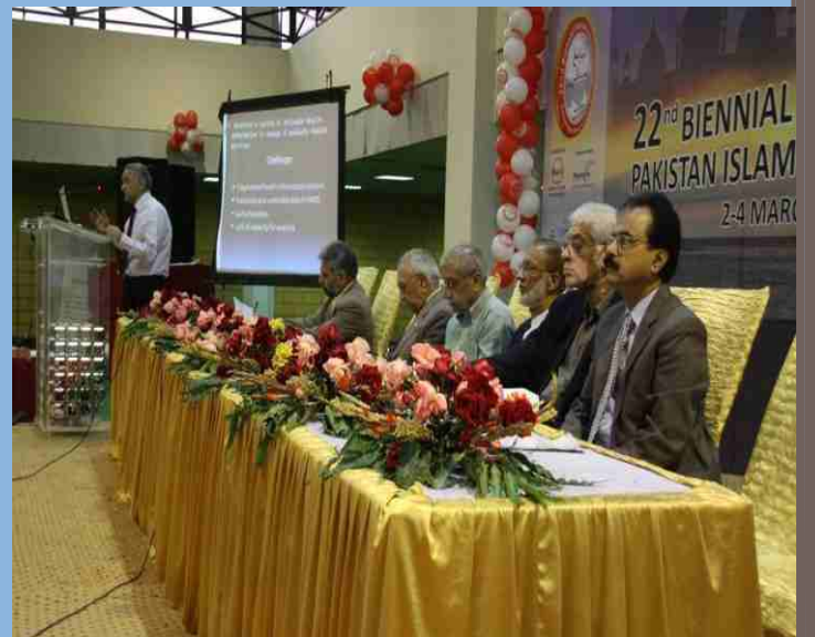
Dr. Adeb ul Hasan Rizvi, an eminent medical figure in Pakistan presiding over a session.