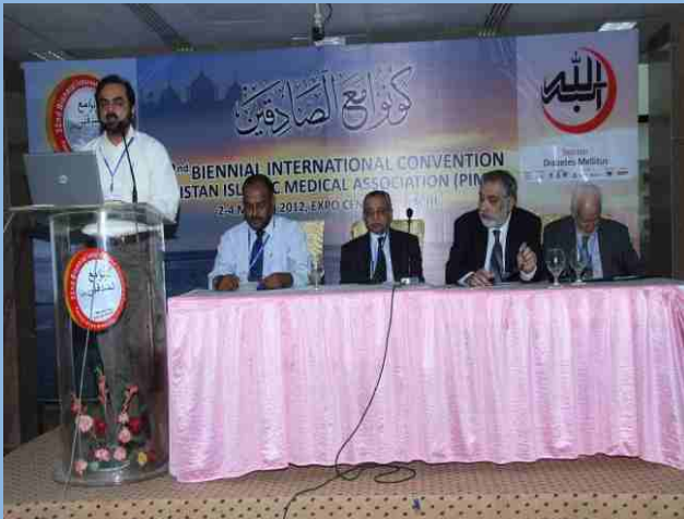
There were more than 50 sessions of scientific meeting during the PIMA Biennial convention Karachi