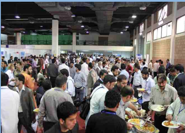
PIMA Biennial convention Karachi, a view of lunch break