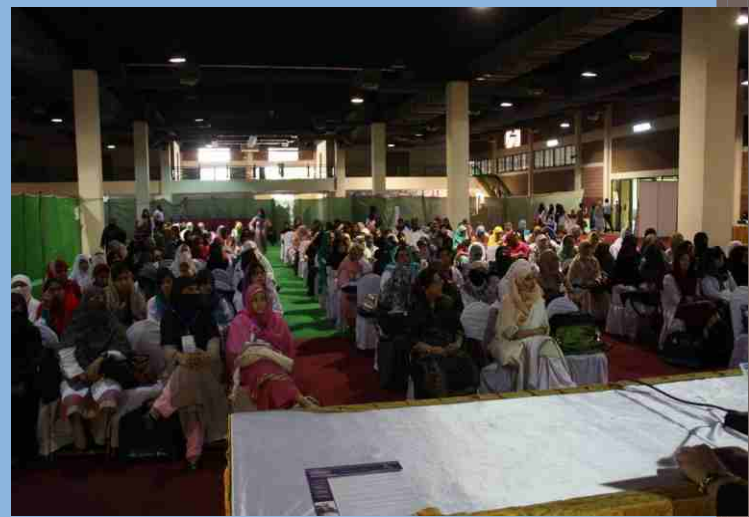
In addition to main programs, special sessions were held by PIMA female wing.