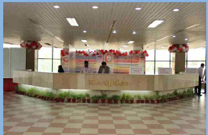
PIMA Biennial convention Karachi, a view of reception desk