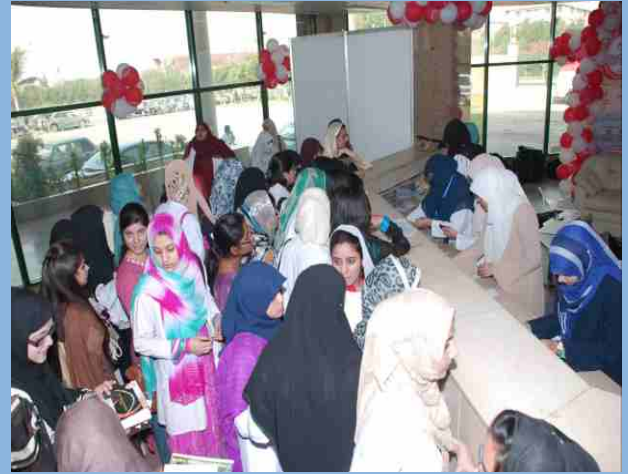
Around 2000 female doctors attended the PIMA Biennial convention Karachi