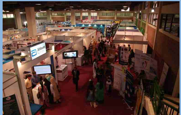
A view of a grand exhibition at the eve of PIMA Biennial convention Karachi