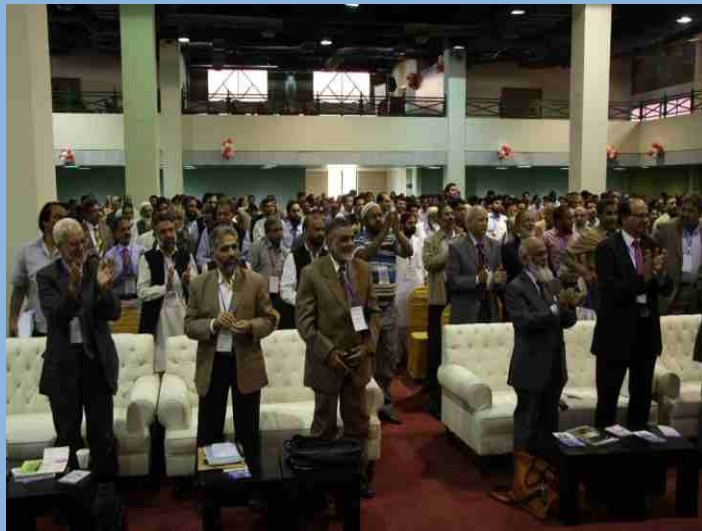
A standing applause given to the out going PIMA President by the audience at PIMA Biennial convention Karachi