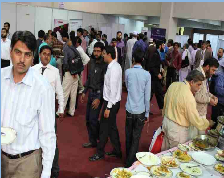
PIMA Biennial convention Karachi attracted the largest number of medics exceeding 5000