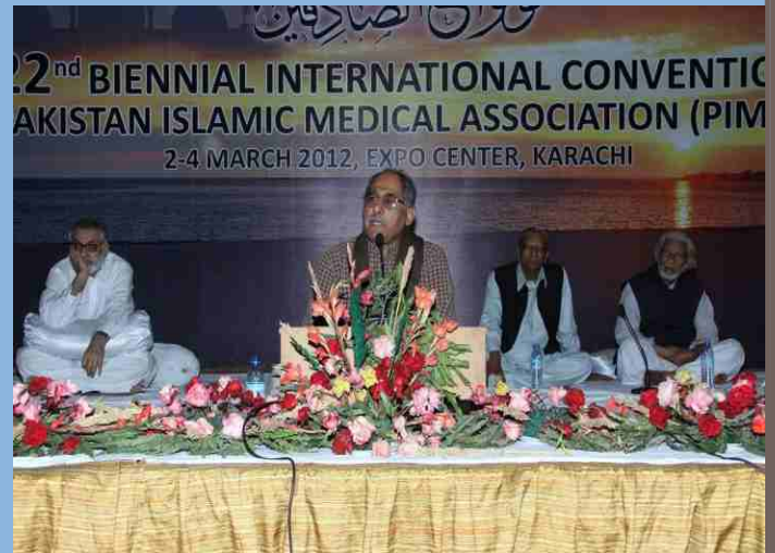
A very well attended social evening, it was a poetry reciting session.